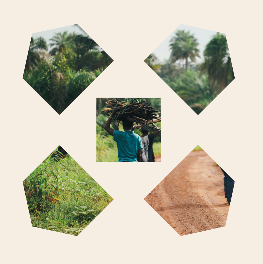
"Love from the center of who you are."

Pray and believe once a week that God will give you an opportunity to demonstrate Christ's love to someone, then give the gift of your time and attention.