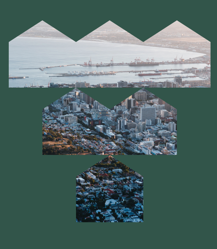
"Love others as you love yourself." James 2:8