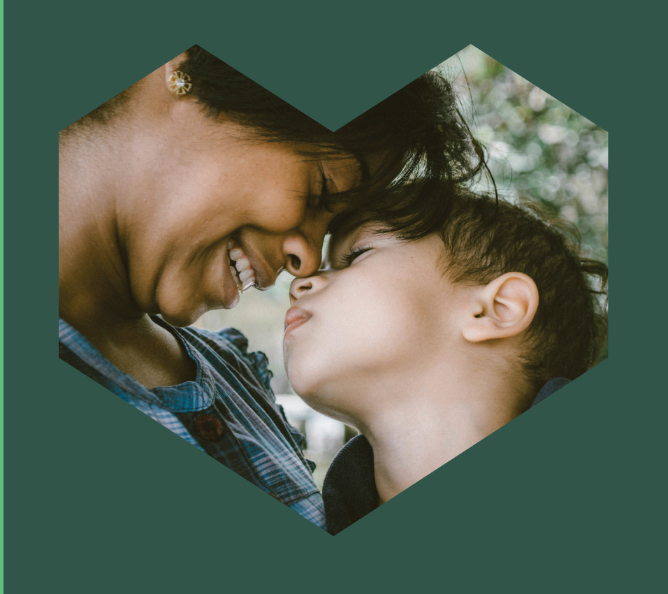
"Let us not love in word or talk but in deed and in truth."